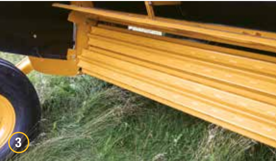
3 The steel roller conditioner option features an aggressive profile that allows for consistent conditioning across the roller. It also provides the ability to break down tough crops but can be adjusted for gentler conditioning of leafy alfalfa crops.