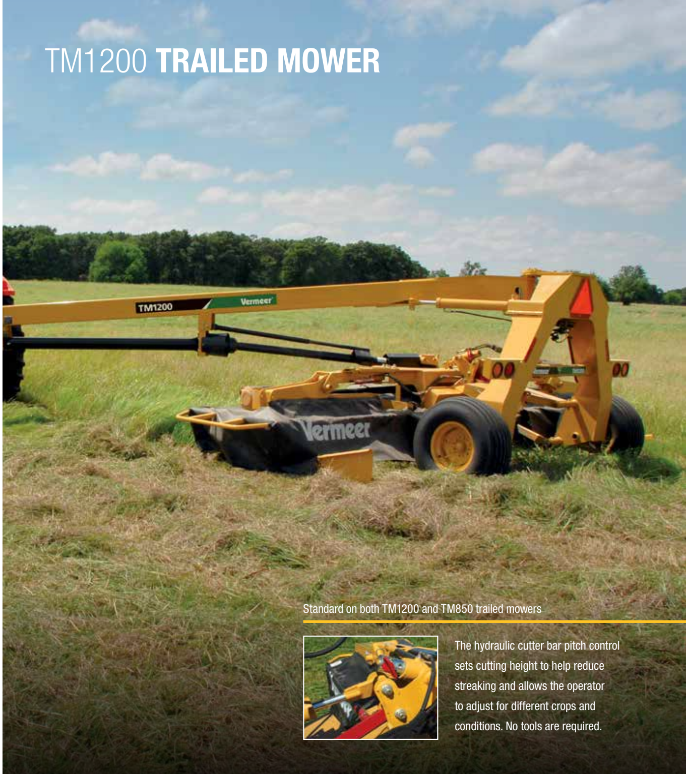
Standard on both TM1200 and TM850 trailed mowers