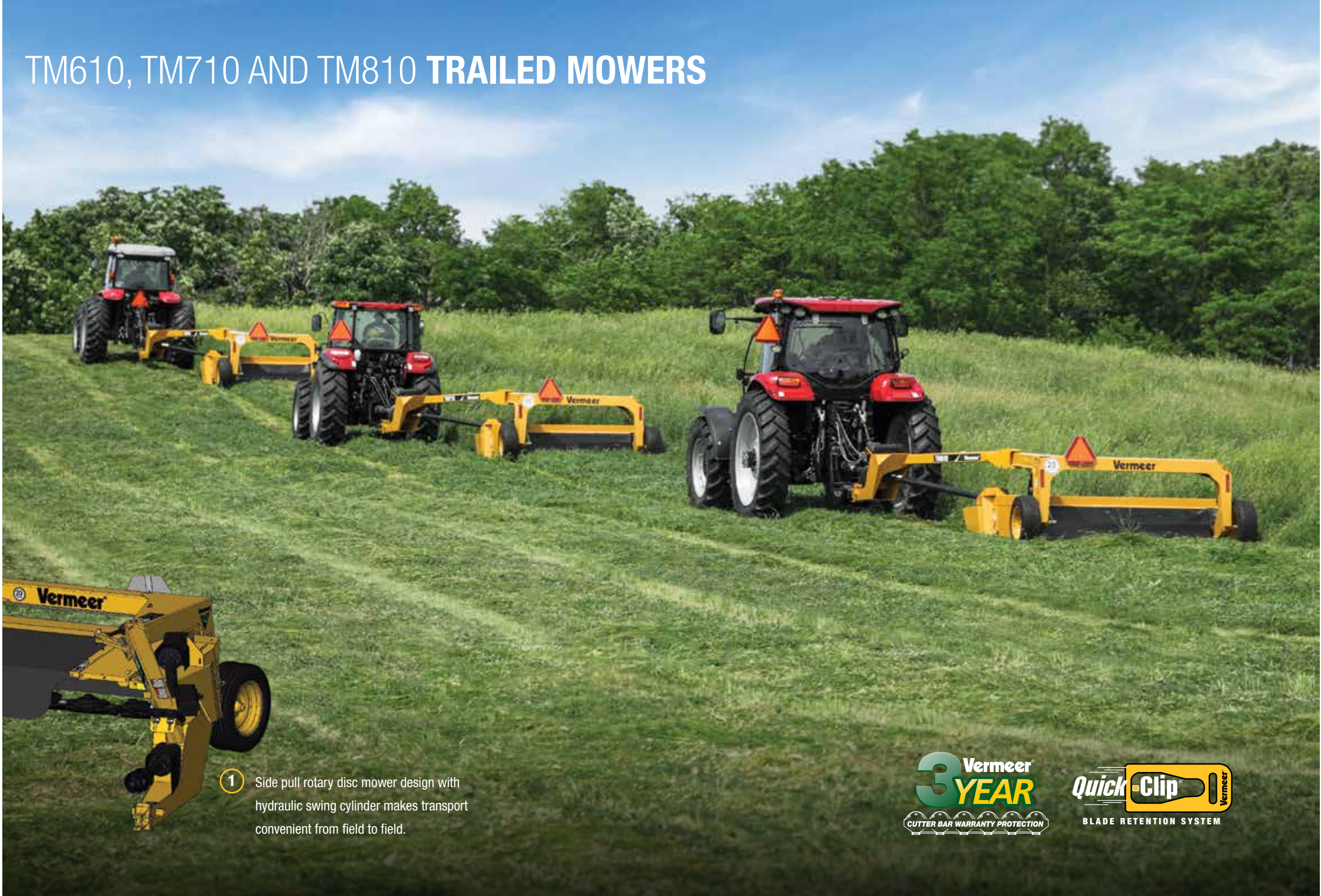
1 Side pull rotary disc mower design with hydraulic swing cylinder makes transport convenient from field to field.