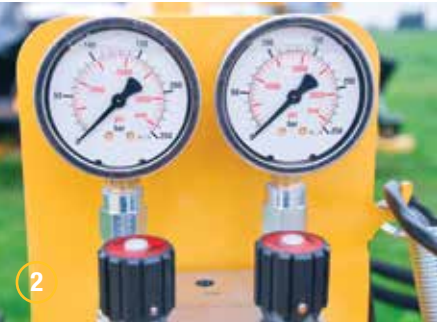
2 The nitrogen-charged accumulator suspension system provides consistent weight on the cutter bar throughout the full range of motion, reducing ground contact and resulting in a consistent cut. With varying field conditions, suspension adjustments can be made quickly and without use of tools, reducing stress on the header and framework, which can result in less field damage and longer mower life.