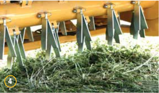
4 The tine conditioner option features free-swinging, steel V-tines which scrape the surface of the material against an adjustable concave plate. The mechanism also offers two speed settings.