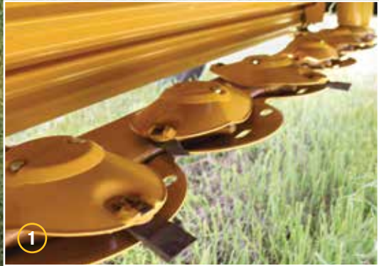
1 The modular cutter bar design allows for cutter units to be repaired individually, reducing the need to take apart the entire cutter bar.